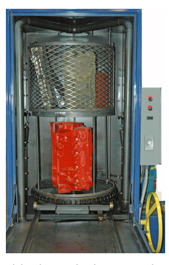
1 blocks with sheetmetal per wash cycle wash cycle